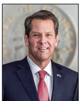
Gov. Brian Kemp 706-745-6292.

Currently, the Towns County Health Department is serving as one of the 105 state-run specimen collection sites. To schedule testing there, residents can call the Towns County Health Department at 706-896-2265 or the Union County Health Department at