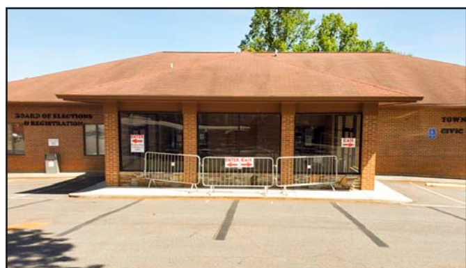
The Towns County Board of Elections & Registration was ready for voters even before the first day of early in-person voting, which started May 18.

To recap, in 2020, the state has conducted a last-minute rollout of brand-new voting equipment, canceled the March 24 Presidential