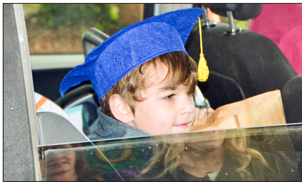
Towns County Elementary hosted a special drive-thru graduation for young students last week, with another round of "graduates" scheduled to receive goody bags this week.